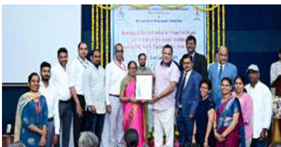
Village Panchayat Sao Matias, Tiswadi, North Goa