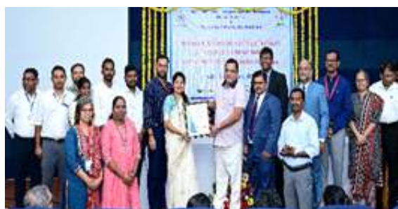
Village Panchayat Harvalem, Bicholim, North Goa

Compiled by: The team of SDU-I under Core Faculty in Decentralized Planning, Monitoring and Evaluation- Goa Institute of Public Administration and Rural Development (GIPARD), Ella Farm Old Goa as per the visits organised by Professor of Practice under RGSA Scheme, MoPR, Government of India.