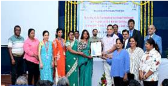
Village Panchayat Sarzora, Salcete, South Goa

The State of Goa marked a significant milestone in strengthening grassroots governance as seven Village Panchayats were awarded ISO certification for adopting professional, citizen-centric, and transparent administrative practices. The ISO certificates were awarded by the Hon'ble Minister for Panchayati Raj, Shri. Mauvin Godinho, to seven Village Panchayats: Volvoi, Sarzora, Sao Matias, Menkurem-Dhumase, Querim-Tiracol, Harvalem and Chicalim at a programme organised by the Goa Institute of Public Administration & Rural Development in collaboration with the Directorate of Panchayat, Government of Goa, held at the Secretariat in Porvorim on 23rd January 2026.