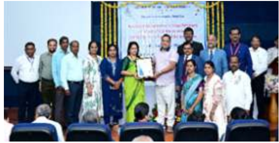
Village Panchayat Querim-Tiracol, Pernem, North Goa