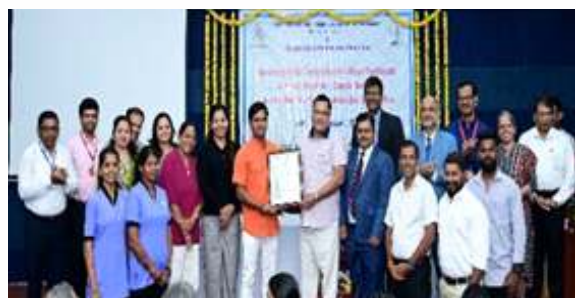
Village Panchayat Chicalim, Mormugao, South Goa