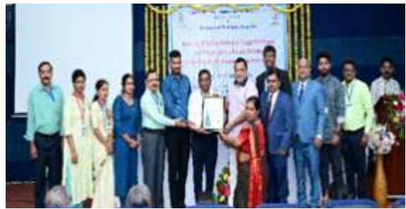
Village Panchayat Volvoi, Ponda, South Goa