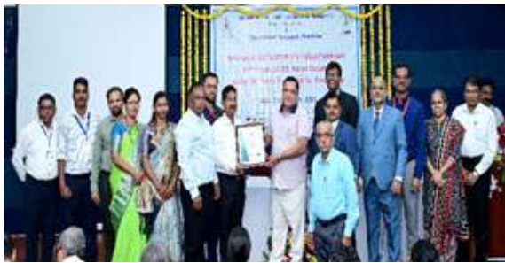
Village Panchayat Menkurem-Dhumase, Bicholim, North Goa