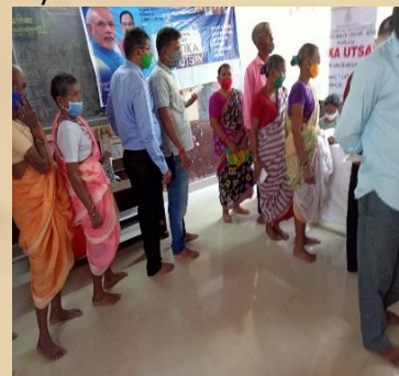
Tika Utsav at Kasarpal Latambarcem for people aged 45 years and above.

Covid Vaccination Camp -Tika-Utsav was planned by the Panchayat and the Health Department, in which she actively participated to motivate and create awareness in Village Panchayat of Kasarpal – Latambarcem. Two camps were conducted, in which 85 villagers above the age of 45 years took vaccine in Ladfe village on 10/04/21 and 80 people took vaccine in Kasarpal village on 16/04/2021.