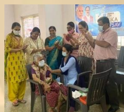
107-year-old senior citizen woman taking Covid Vaccine during Tika Utsav at Mulgao.