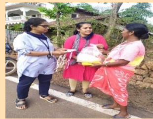
Distributing essentials to people in remote areas.

Due to lockdown, all transport and shops were closed. People were not allowed to move out of house and face masks were need of the hour. Calls from health centres, police department were coming in to supply masks to them. In this situation, she somehow contacted the Chief Officer of Mapusa Municipal Council and requested him to grant the permit to just open the backdoor of a well-known clothing shop in order to get cloth material required for making masks. This is how they could supply face masks. Also, her neighbours and family members were bit hesitant to send her out of the house as there was panic and lack of clarity in the society regarding the Covid-19 situation.