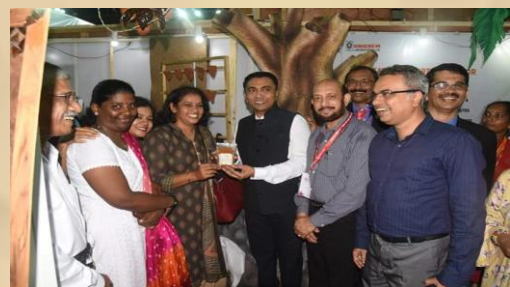
Showcasing a Goan item to Goa Chief Minister Dr. Pramod Sawant at Vibrant Goa Summit.