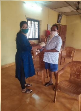
Providing essentials and other goods to senior citizen during pandemic situation

More than 100 SHG members were involved in these activities.