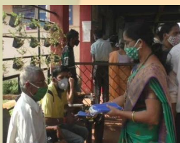
Distribution of masks to people at Tika Utsav.