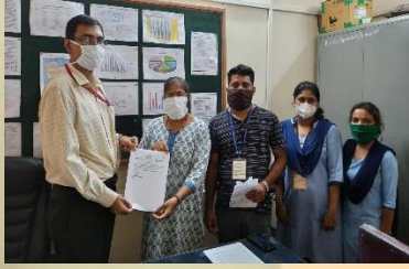
Appreciation Certificate received from Candolim Primary Health Centre.