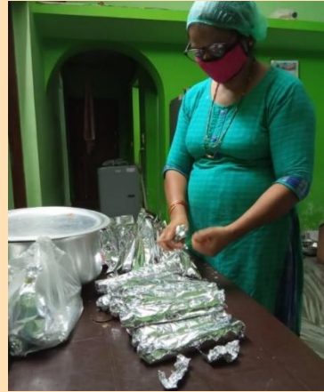
Packing of chapatis and bhaji for Covid-19 affected patients and families

which needed to be dealt with at the earliest. But there was no labour present and also a shortage of funds. She then approached some youth in her ward and asked if they were willing to help in this program to which they happily agreed. As a VO Chairperson, she called the Fire Station and requested for water supply and sanitizing liquid and involved the youth in the sanitizing the wards. On hearing that the women in the SHGs are taking such keen interest in cleaning and spreading social awareness during the pandemic the Village Panchayat were surprised and wholeheartedly supported the initiative.