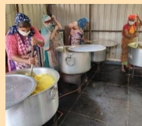
Preparation of food in kitchen for distribution during lockdown situation.