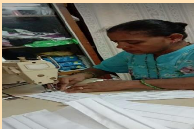
Stitching of masks by members of SHG for distribution.

Under this program more than 106 women got a chance to earn livelihood. Almost 15,000/- was earned by each woman involved in the stitching work. More than 50,000 face masks were made and delivered to the private as well as public sector.