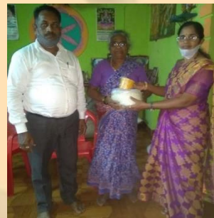
Distribution of essential goods to senior citizens during pandemic situation

She has also provided free essential items to senior citizens living in Sirigao and Mulgao Panchayat areas during the pandemic period.