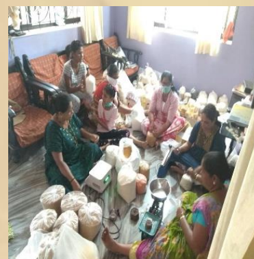
Packaging of grocery and daily essentials at home with help of other members.

began later on. People started facing shortage of daily ration, grocery and other daily necessities. She started receiving phone calls from many people under her ward. She started distributing some groceries in the area. Unfortunately, problems were just piling up. If groceries were done than ration, cereals were not available. Thinking that people need to be fed and keeping in mind that most of the needy people in her ward were old and unable to move out or earn a living during that time, she used her own money to buy ration such as rice, wheat flour, dal, and other cereals. For this she said that she took help from her husband and son. The senior citizens were attended to in the village.