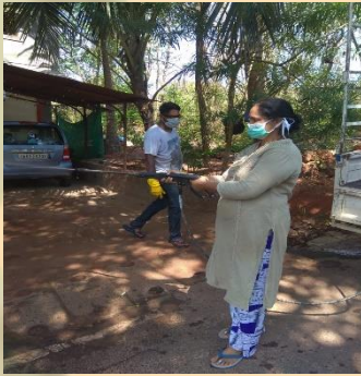
Sanitizing and cleaning of wards from her Village Panchayat during pandemic situation with the help of village youth.

When second wave of Covid -19 hit Goa, Aldona area was declared to be red zone at that period, almost 200 food parcels every day for the lunch and dinner were supply to the Aldona Food Helpline which provides free nutritional vegetarian food for the Covid-19 patients in Aldona Constituency.